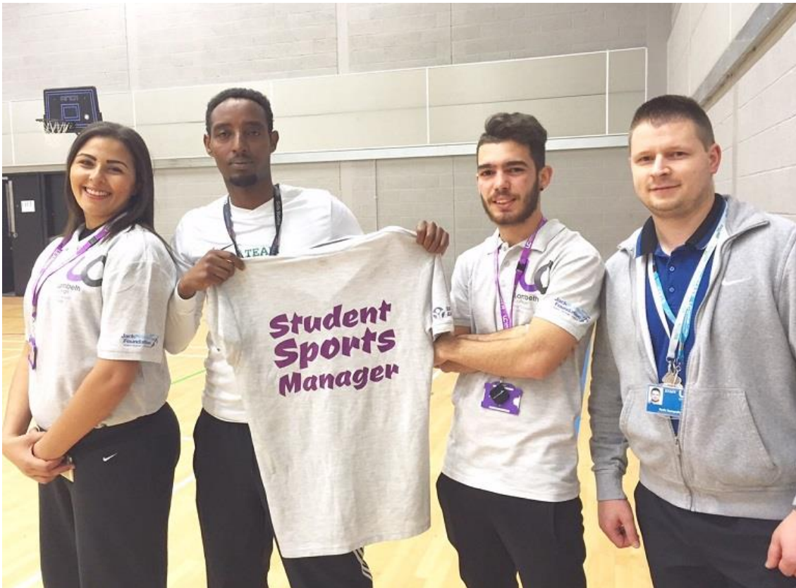
The College Sports Maker and the Sports Activators